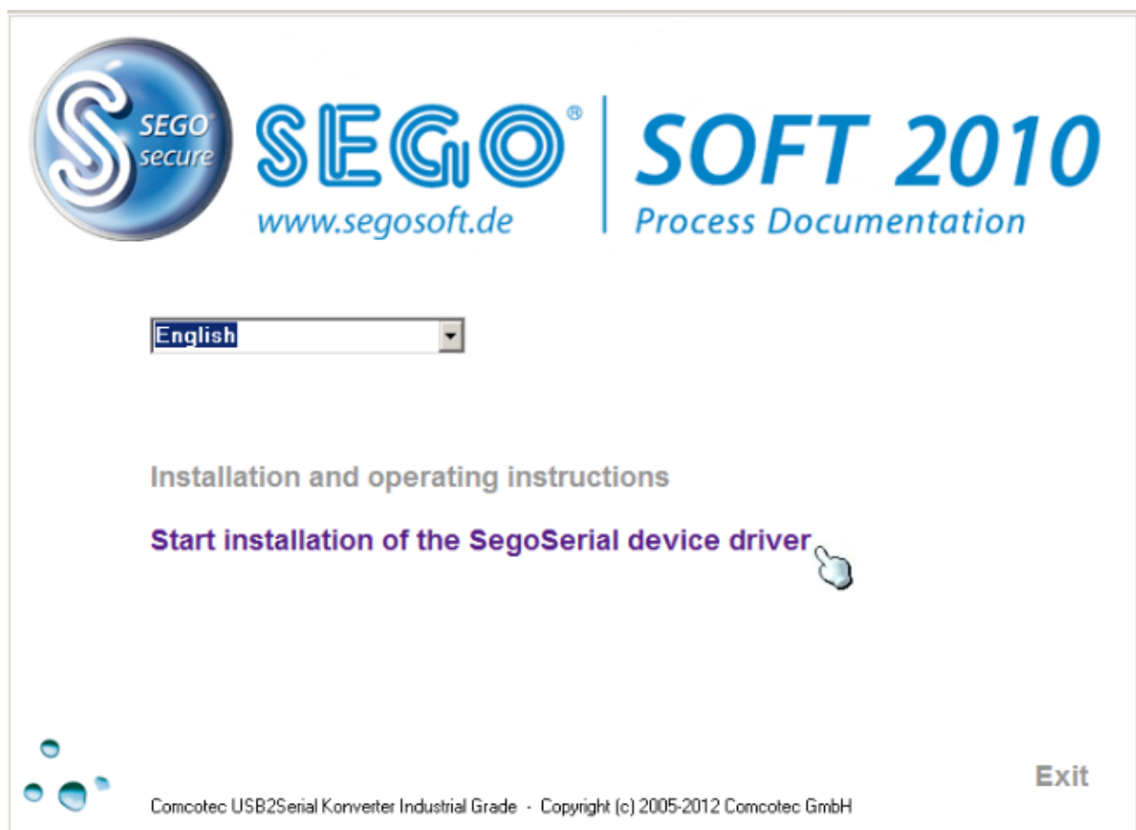
Fig.: Setup SegoSerial

You will now see the following window on your screen: